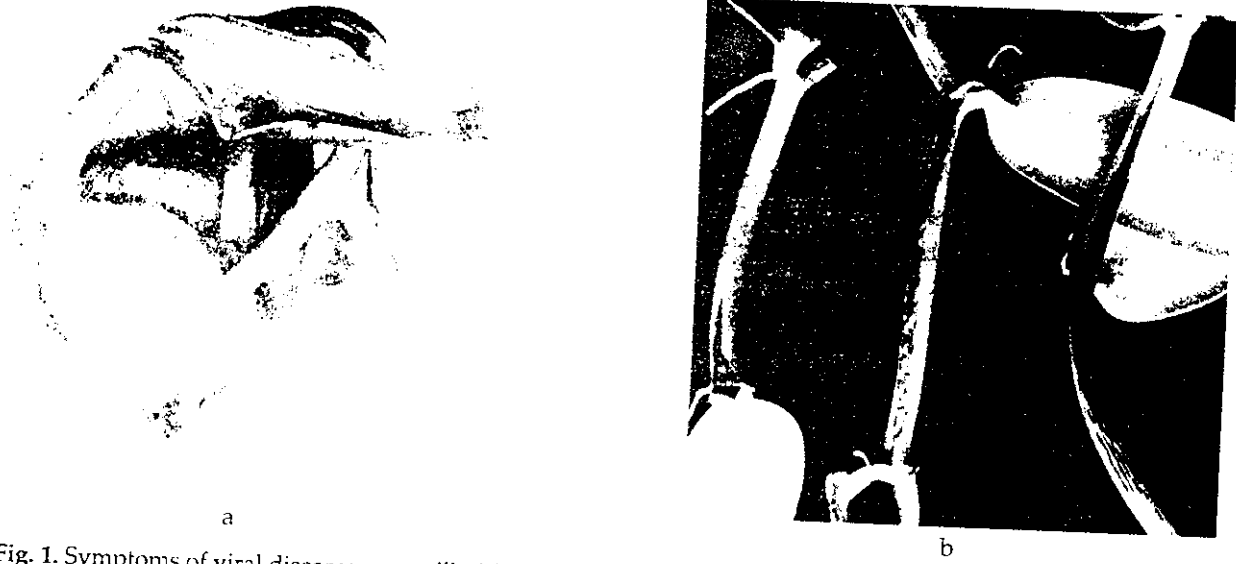
Fig. 1. Symptoms of viral diseases on vanilla (a) mosaic affected plant showing mosaic, severe crinkling, twisting of leaves and shoot (b) stem necrosis affected plant showing necrosis of varying length at the stem region.