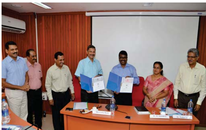
A snap shot of signing of MoU by ICAR-IISR Director and KITCO representative

ICAR-IISR has entered into a Memorandum of Understanding with Kerala Industrial and Technical Consultancy Organization Ltd. (KITCO) on 31 March 2015 in an effort to jointly promote entrepreneurship development. IISR is planning to provide pre-incubation training, market potential studies etc. to the aspiring entrepreneurs through KITCO.