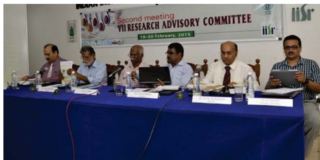
A view of the inaugural session of RAC meeting