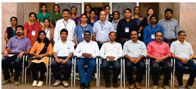
Participants of the training programme with the course Director, course coordinators and resource persons