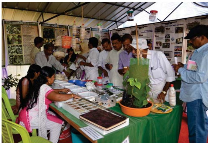
A view of KVK stall in one of the exhibitions