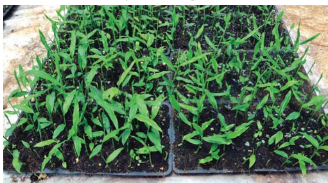
Ginger seedlings raised using on-farm compost in Pro-tray