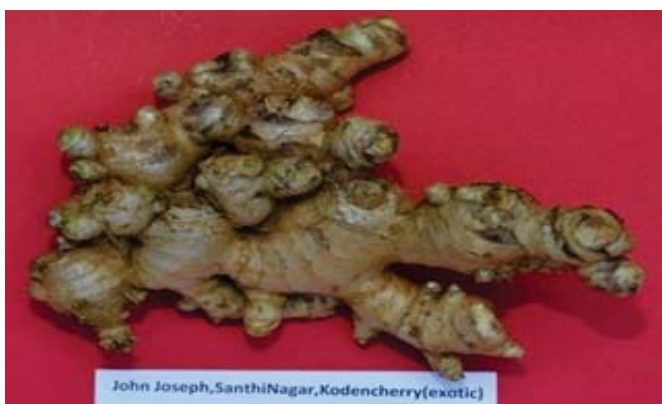
An extra bold type ginger added to the germplasm collection

Under the black pepper germplasm collection programme, survey was conducted in Mankulam forest range and 85 accessions were added to the germplasm pool. A Population of Piper barberi - an endangered species listed in the Red Data Book was located at the Anakulam forest range. Five ginger accessions including an extra bold type (Source: Mr. John Joseph, Kodencherry) were collected and conserved in the gene bank.