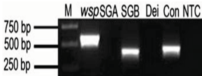
PCR amplification of the wsp gene for detection of Wolbachia groups in Sciothrips cardamomi . Lane 1 - Molecular weight marker; Lane 2 - wsp gene; Lane 3 - Super group A; Lane 4 - Super group B; Lane 5 - Subgroup Dei; Lane 6 - Subgroup Con; Lane 7 - Non template control.

Studies indicated that the cardamom thrips, Sciothrips cardamomi harbours the bacterial endosymbiont, Wolbachia sub-group Con belonging to Super Group B in both male and female thrips collected from various cardamom growing districts in India. This is the first report of Wolbachia infection in cardamom thrips. The findings were published in Invertebrate Reproduction and Biology.