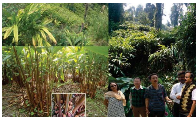
Large cardamom plantation in the hill slope of Anjaw district of Arunachal Pradesh