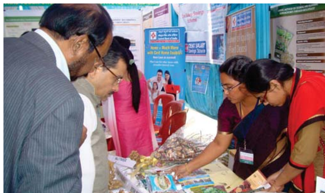
Exhibition of IISR technologies at ICAR-IIHR, Bengaluru

In an attempt to promote commercialization of technologies, ICAR-IISR participated and exhibited the technologies in the Fourth Horticulture Institute-Industry Interface Meet held on 10 February 2015, organized by ICAR-Indian Institute of Horticultural Research, Bengaluru.