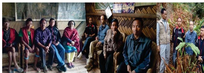
Team interacting with tribal cluster of Lungwah village at Indo Burma border