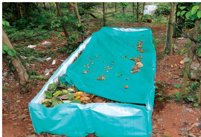
Readymade compost bin

Composting is an integral part of ICAR-IISR farm activities for effective recycling of organic waste, besides keeping premises neat and clean. The leaf fall from avenue trees and farm wastes are regularly converted into valuable manure. Both conventional compost pit and readymade compost bin (3.0 m x 1.0 m x 0.5 m) made with plastic sheet are placed at convenient locations for making compost. On an average 2.0 tonnes of compost is produced annually and used for potting mixture in the nursery.