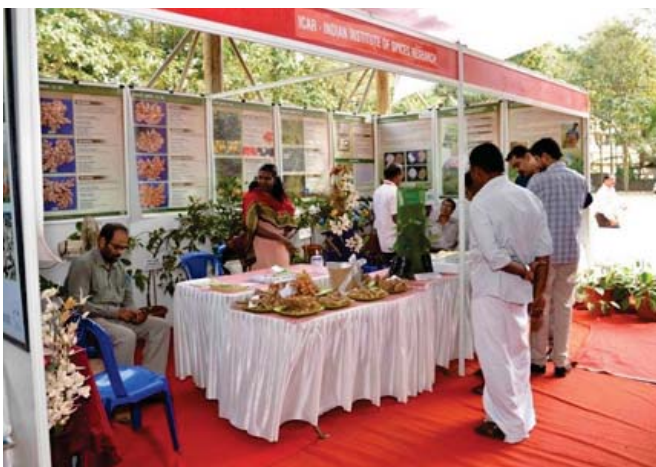
A view of one of the exhibitions organized by ICAR-IISR