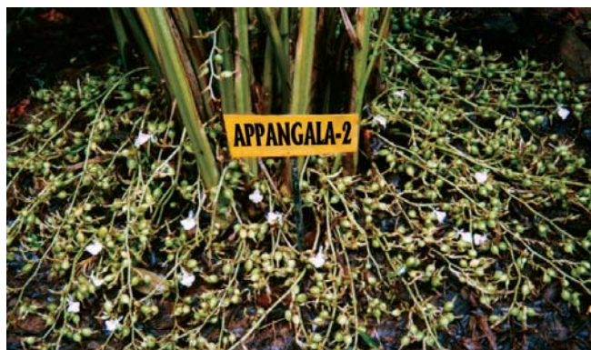
Appangala 2 cardamom variety

A high yielding cardamom hybrid, Appangala 2 resistant to Cardamom mosaic virus (CdMV) or katte with average yields of 927 kg/ha has been developed. It was evolved by crossing high yielding local cultivar (CCS 1) with 'katte' virus resistant genotype (NKE 19). The variety is recommended for release in Karnataka in the XXV AICRPS workshop held at UBKV, Pundibari, West Bengal during 25-27 September 2014.