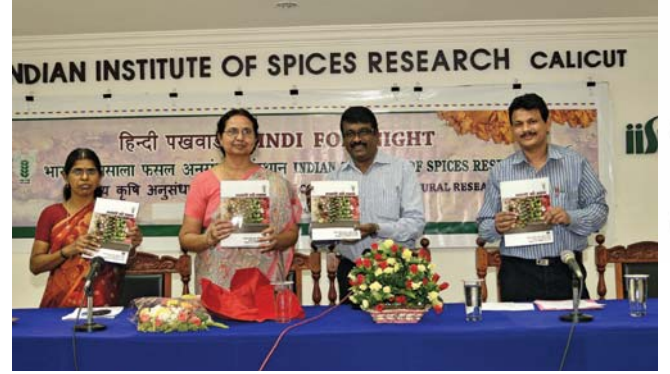
राजभाषा पत्रिका मसालों की महक के द्वितीय अंक का विमोचन

तिमाही में मसाला समाचार खण्ड 25 भाग 2 तथा अनुसंधान के मुख्य अंश 2013-14 का प्रकाशन किया गया। संस्थान की राजभाषा पत्रिका मसालों की महक के तृतीय अंक को प्रकाशित करके दिनांक 29 सितम्बर 2014 को हिन्दी पखवाडा समापन समारोह में मुख्य अतिथि द्वारा विमोचित किया गया।