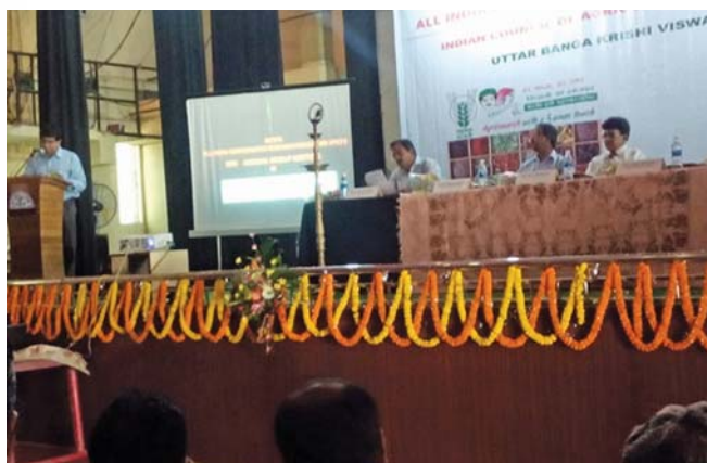
Inaugural function of the AICRPS workshop in progress

variety (recommended for Andhra Pradesh and Telangana region) were released during the workshop. Nine technologies for various states were recommended.