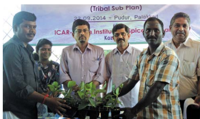
Tribal farmers of Attappady receiving black pepper planting material in pro-trays