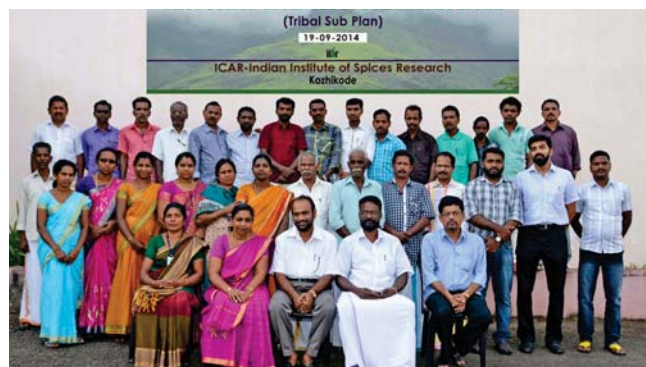
Participants (from Sugandhagiri) of training programme on black pepper production technology