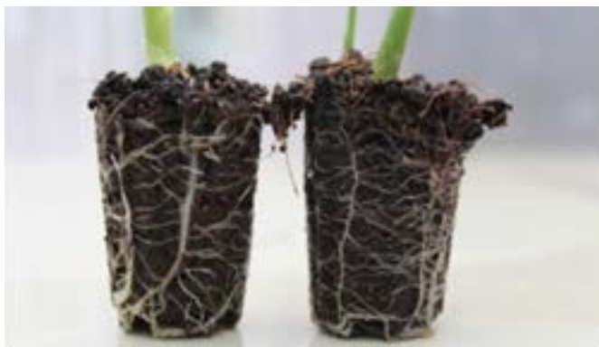
Effective root system of single bud derived plants