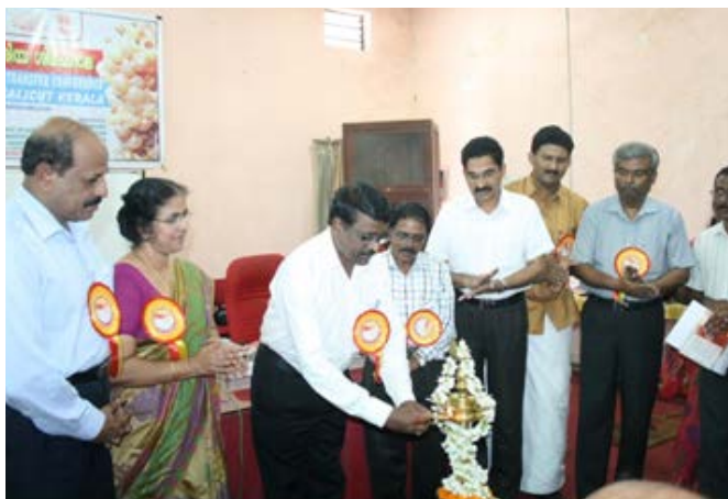
Inauguration of the workshop on Meliponiculture

The KVK organized National workshop on Meliponiculture at KVK during 20 - 21 March 2014 under the financial assistance of National Bee Board, New Delhi. 178 farmers participated in the programme.