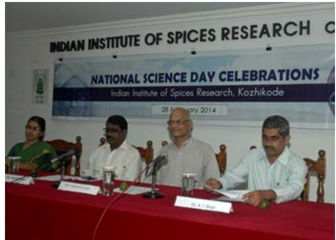
A view of National Science Day celebrations