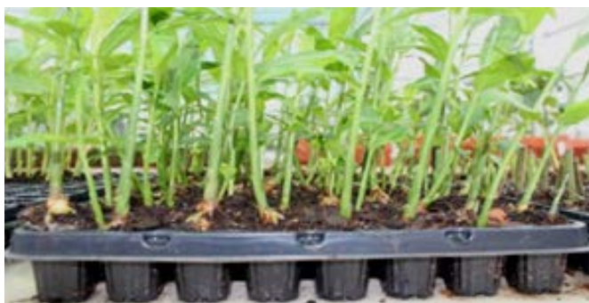
Ginger plants derived from single bud ready for transplanting

A transplanting technique in ginger by using single bud sprouts raised in pro-trays was standardized. The results of replicated trial with different treatments revealed no significant difference for fresh yield between single sprout transplanted and direct planting of 20-25g seed rhizomes. The advantages of this technology are low cost production of healthy planting materials and reduction in seed rhizome quantity.