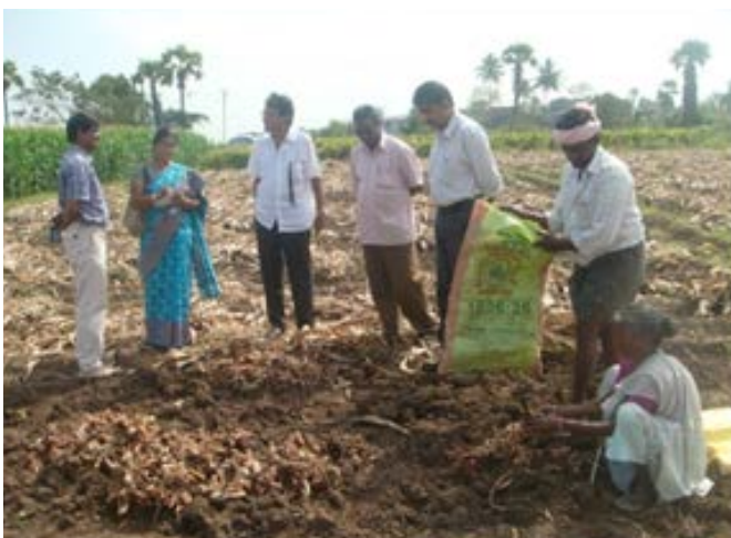
NHM plot harvest at Guntur

Crop cutting survey and harvest festival was organized in connection with the harvest of IISR Prathiba turmeric in the 4 FLD plots under NHM in Guntur district, AP. A two day training programme was also organized at the same time (20-21 January 2014) in which 68 farmers from various districts of AP participated. The programme was covered by the DD Sapthagiri, Regional Telugu channel of Doordarshan and was telecasted state-wide.