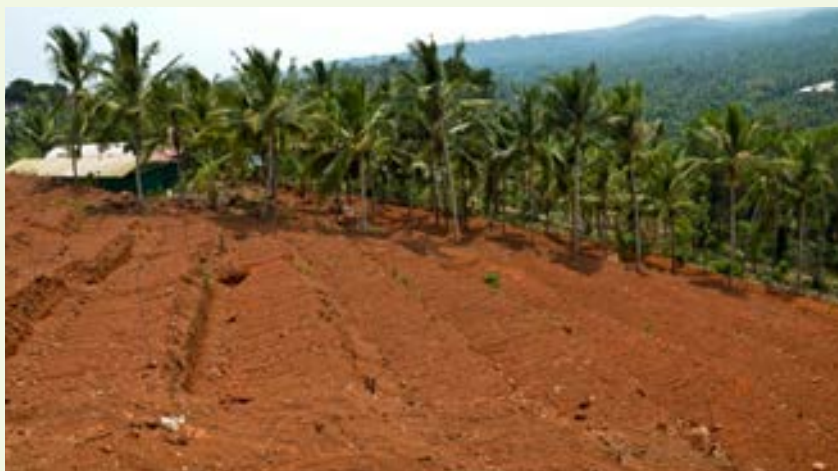
Terraces ready for planting at Chelavoor campus