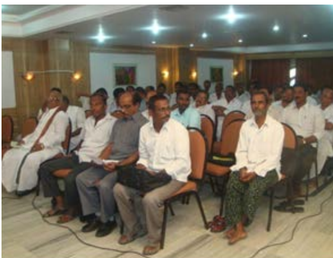
Farmers listening to a lecture at Guntur training programme