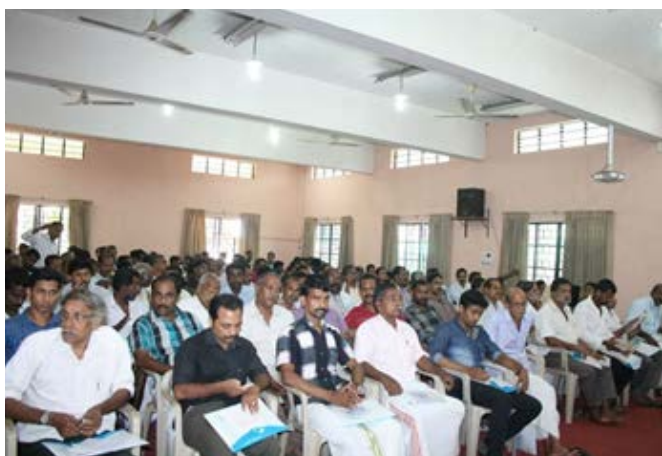
Huge farmers turn out for the Meliponiculture workshop