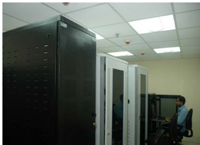
Data centre facility

from the stand alone webserver, mailserver etc. , a High Performance Computing (HPC) facility has also been set up exclusively for the analysis of next generation sequence (NGS) data. PhytoFuRa-HPC is a cluster of three nodes with GPU accelerators and high speed (InfiniBand) connections between nodes. Each node is with 8 processing cores, 48GB of RAM, and Intel Xeon processors. The processing speed of the HPC is 1.4 TF.