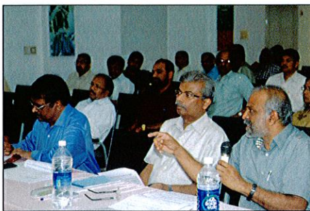
External experts interacting with Scientists during IRC meeting

Keeping in view the ICAR slogan "Farmer First" the institute made a vow about a year ago 'To make the technologies visible'. Subsequently, during the Institute Research Council Meeting held in April, a session with extension agencies was arranged and debated on the technologies ready for adoption in the field, viz., PGPR for growth promotion, nutrient mixtures for alleviating micronutrient deficiencies etc. It is now gratifying to note that IISR has made giant strides by developing technologies that are ready for licensing. Of course, the ball was set rolling when we successfully licensed our spice varieties. Due to intellectual property right (IPR) related issues, protection of technologies and varieties are a matter of great concern. IPRs are of course vital in a knowledge-based economy, because