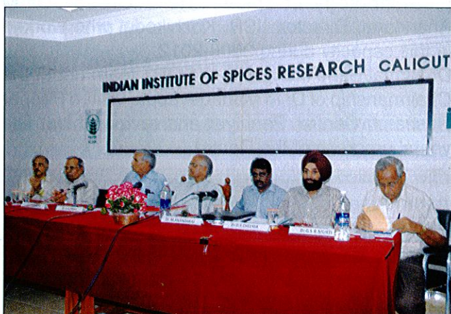
Director with QRT members