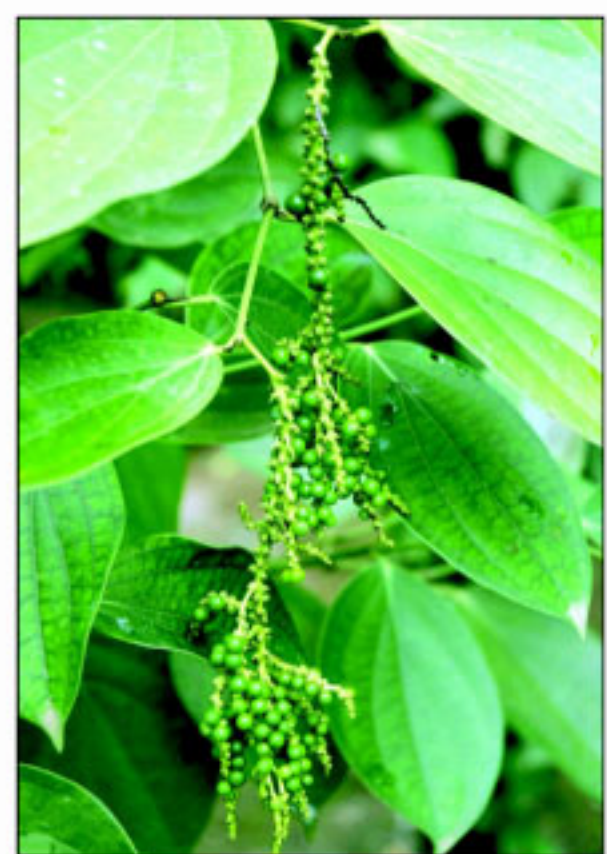
Spike proliferation in Black pepper

Mutations in the floral identity genes, which are conserved gene families across plant kingdom, result in conversion of floral meristem to inflorescence meristem. A multi-branching black pepper accession collected from a farmer's nursery a few years back, and maintained at the black pepper repository of Indian Institute of Spices Research, Kozhikode has now spiked, proving true to its character, where all the spikes are of proliferating nature.