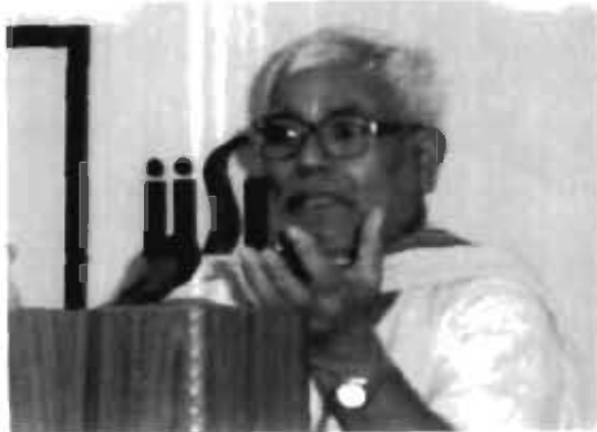
Hon'ble Minister of State for Agriculture, Govt. of India, addressing the staff members at IISR, Kozhikode