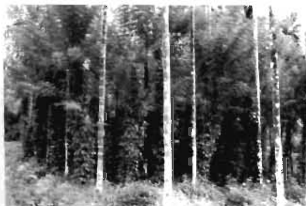
Piper chaba in arecanut garden

Java long pepper ( Piper chaba ) is one of the best choice crops to be intercropped with arecanut at 1.35 x 1.35 m spaced lines support of Glyricidia . Easily 4000 plants can be accommodated in one hectare of arecanut yielding 540 kg dry spikes/ha. At the rate of Rs. 60 kg -1 an income of Rs. 32,400 ha -1 can be obtained.