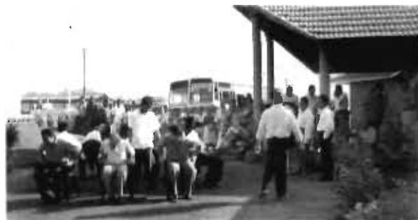
Musical chair competition in connection with Republic Day Celebrations

The Institute Recreation Club conducted many programmes during the period including ICAR Foundation Day, Vigilance Awareness Week, Republic Day, Onam Festival and also honoured the Institute Staff who won awards.