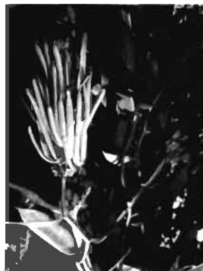
A multibranching inflorescence type vanilla

Eight cultivated black pepper accessions collected from Idukki District got established in the ex situ Piper gene bank, IISR, Kozhikode. A black pepper with multibranching spike was also collected from Idukki and added to the gene bank, besides two collections from Koruvarkundu of Malappuram District, Kerala.