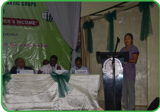
FEEDBACK FROM SPICE GROWER