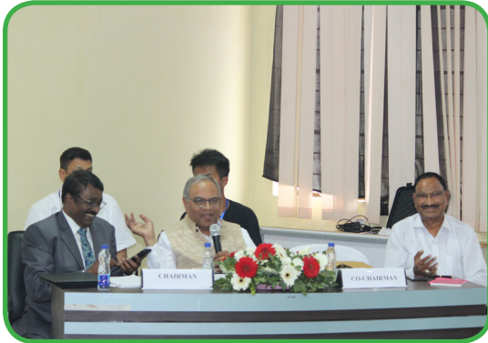
CHAIRMAN AND CO-CHAIRMAN OF TECHNICAL SESSION IV