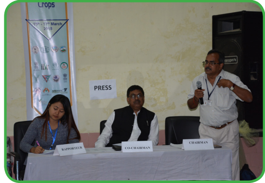
CHAIRMAN, CO-CHAIRMAN & RAPPORTEUR OF BUYERS AND SELLERS MEET