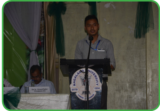
SUPPLIER GIVING FEEDBACK