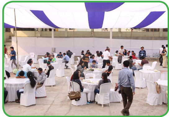
PARTICIPANTS ENJOYING MEALS