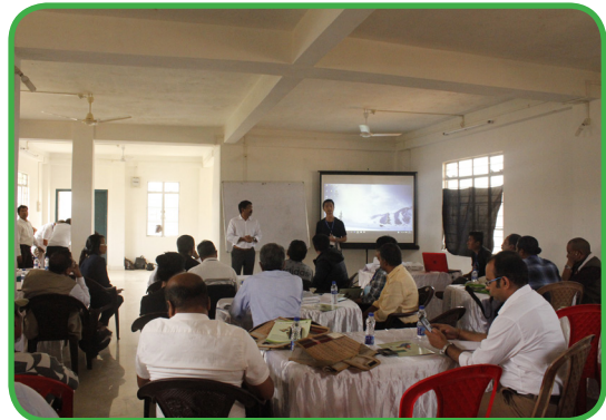
BUYERS MAKING PRESENTATION