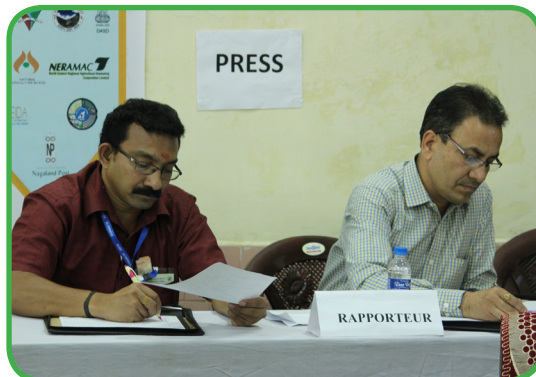
RAPPORTEUR OF TECHNICAL SESSION I