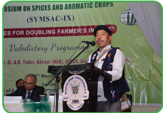
FEEDBACK FROM EXHIBITOR