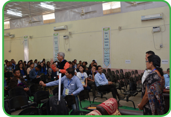
SUBJECT EXPERT INTERACTING WITH FARMERS