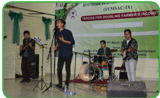
PERFORMANCE BY LOCAL CULTURAL TROUPE