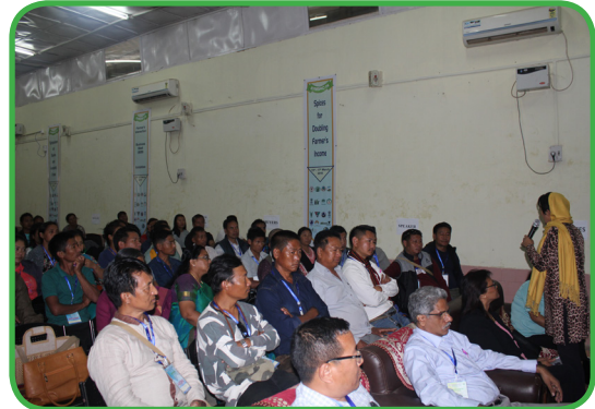
NAGA LADY ENTREPRENEUR ENCOURAGING THE FARMERS