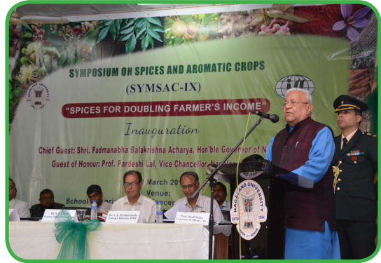
CHIEF GUEST SHRI. P.B. ACHARYA, HON'BLE GOVERNOR OF NAGALAND, GIVING INAUGURAL ADDRESS