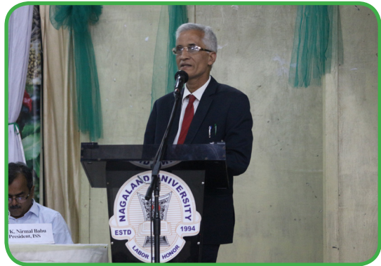
FEEDBACK FROM SCIENTIST