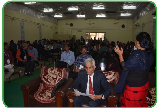
SUBJECT EXPERT REPLYING TO FARMERS QUERY