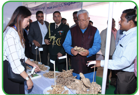
HON'BLE GOVERNOR OF NAGALAND EXAMINING THE EXHIBITS