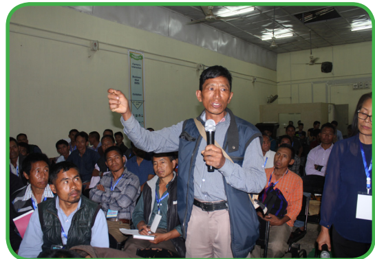
A GROWER INTERACTING WITH THE SUPPLIERS AND BUYERS