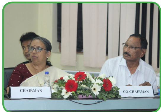
CHAIRMAN AND CO-CHAIRMAN OF TECHNICAL SESSION V