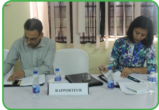
RAPPORTEUR OF TECHNICAL SESSION IV