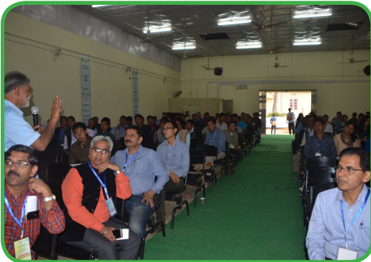
SUBJECT EXPERT INTERACTING WITH FARMER