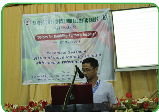
PAPER PRESENTER OF TECHNICAL SESSION I