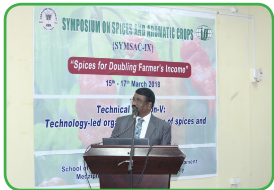
ORAL PRESENTER, TECHNICAL SESSION V