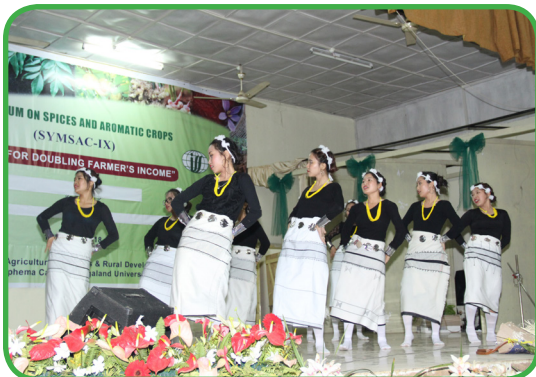
STUDENT PERFORMING AN ARUNACHAL DANCE