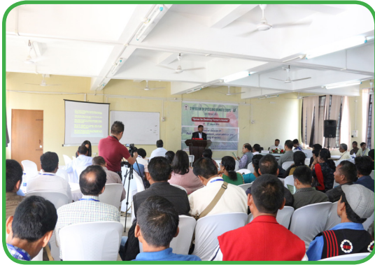
PRESENTER IN TECHNICAL SESSION VI