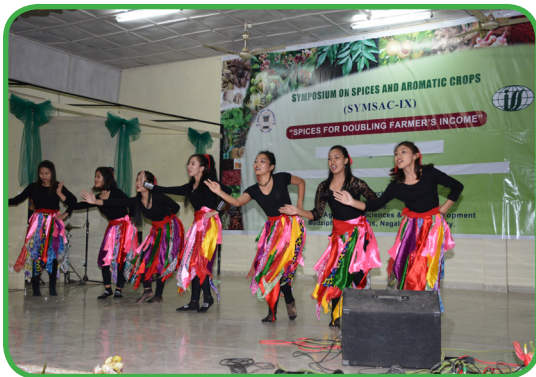
STUDENTS PERFORMING A DANCE