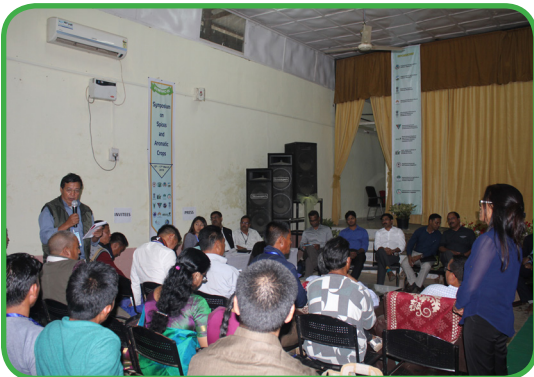
SUPPLIER INTERACTING WITH BUYERS AND GROWERS.