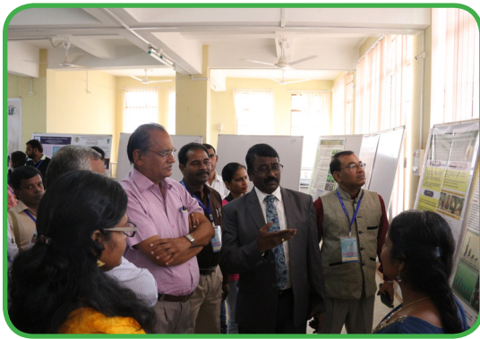
INTERACTION BETWEEN POSTER PRESENTER AND DELEGATES