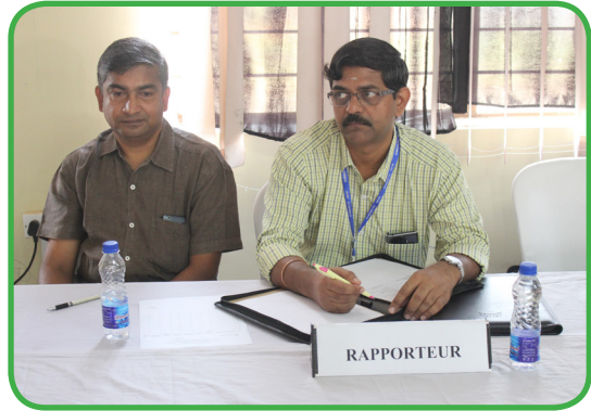
RAPPORTEUR OF TECHNICAL SESSION VI