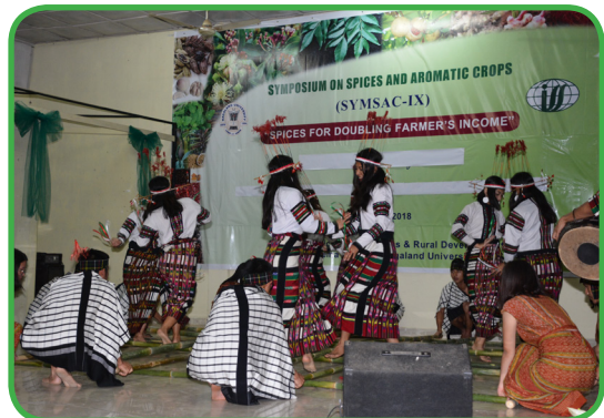
STUDENTS PERFORMING MIZO BAMBOO DANCE