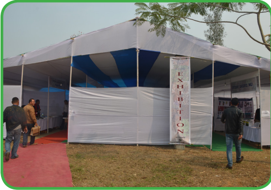
EXHIBITION HALL, SYMSAC-IX