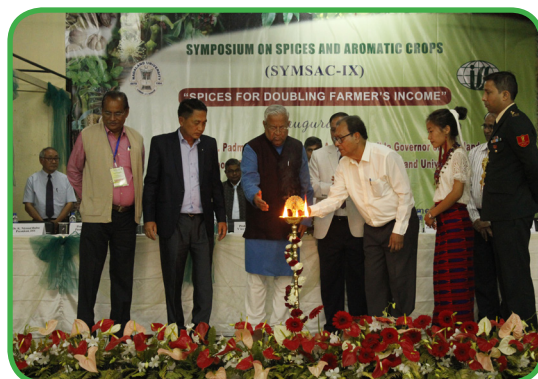
OPENING OF SYMSAC-IX (LAMP LIGHTING)