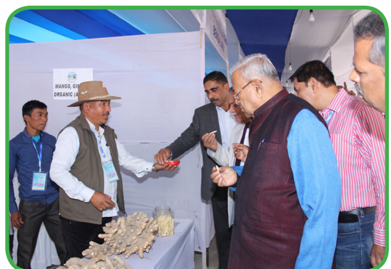
HON'BLE GOVERNOR OF NAGALAND TASTING MANGO GINGER