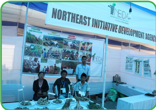
EXHIBITORS AND THEIR PRODUCTS