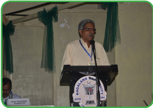
FEEDBACK FROM SCIENTIST