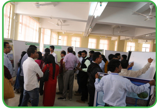
POSTER PRESENTATION SYMSAC-IX