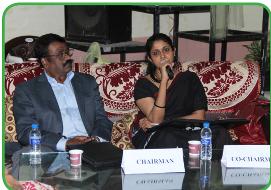
CHAIRMAN AND CO-CHAIRMAN OF TECHNICAL SESSION I