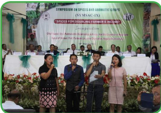
Special number by EU members