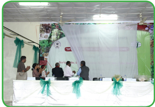
CLOSING OF SYMSAC-IX