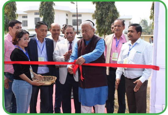
CHIEF GUEST, Shri P.B. ACHARYA HON'BLE GOVERNOR OF NAGALAND INAUGURATING THE EXHIBITION HALL