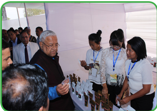
HON'BLE GOVERNOR OF NAGALAND INTERACTING WITH THE EXHIBITORS