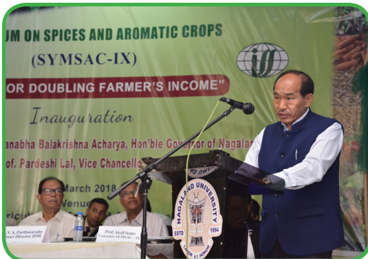
ADDITIONAL DIRECTOR OF AGRICULTURE, GON. GIVING A BRIEF REMARK