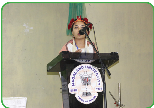
FEEDBACK FROM STUDENT