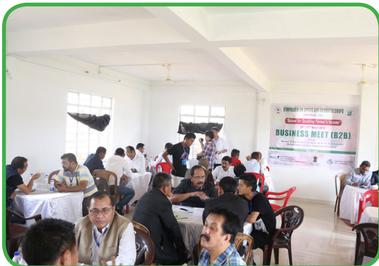
INTERACTION OF BUYERS AND SUPPLIERS