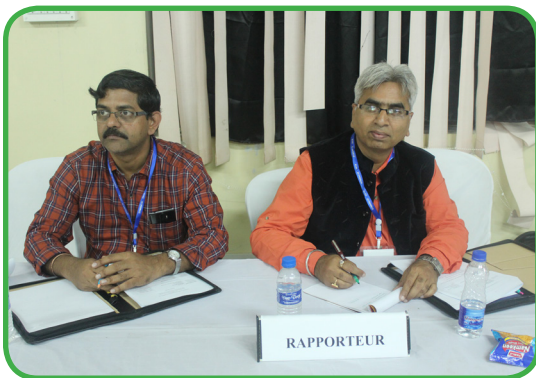
RAPPORTEUR OF TECHNICAL SESSION V