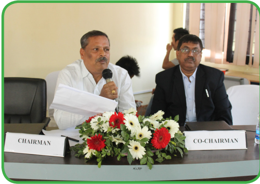
CHAIRMAN AND CO-CHAIRMAN OF TECHNICAL SESSION VI