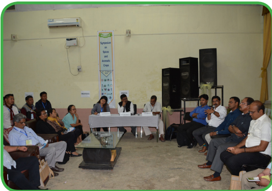
BUYER INTERACTING WITH THE SELLERS