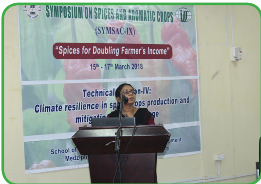
ORAL PRESENTER, TECHNICAL SESSION IV