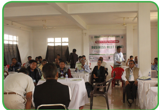
Discussion time for buyers and sellers