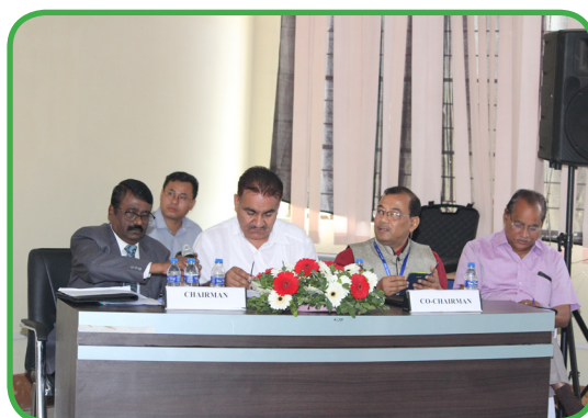
CHAIRMAN AND CO-CHAIRMAN OF TECHNICAL SESSION II AND III