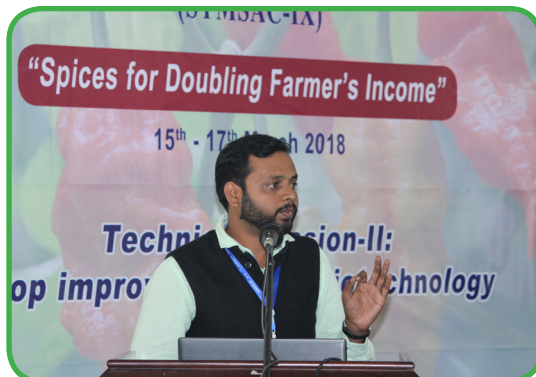
ORAL PRESENTER, TECHNICAL SESSION II