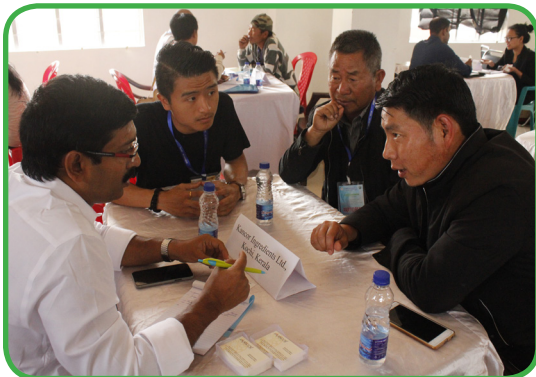
DISCUSSION BETWEEN A BUYER AND SUPPLIER