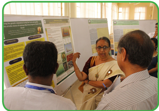
INTERACTION BETWEEN POSTER PRESENTER AND EVALUATORS