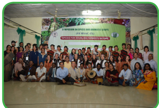
GROUP PICTURE: DELEGATES AND THE STUDENT PERFORMERS