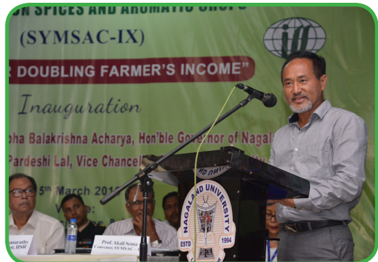
DEPUTY DIRECTOR OF HORTICULTURE, GON, GIVING A BRIEF REMARK