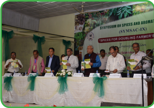
RELEASING OF SOUVENIR SYMSAC-IX