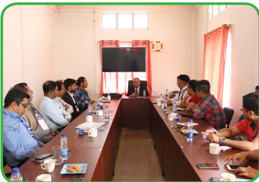
MEETING WITH APEDA