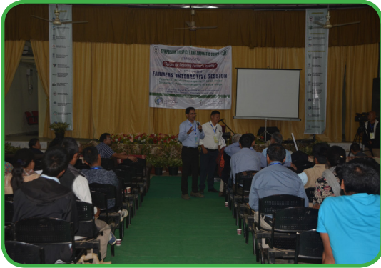
FARMERS' INTERACTIVE SESSION