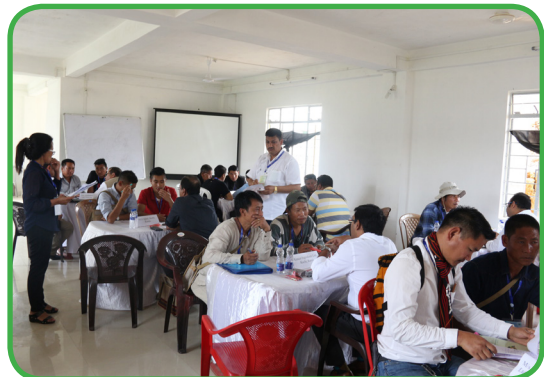
DISCUSSION BETWEEN BUYERS AND SUPPLIERS