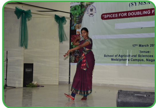
STUDENT PERFORMING A CLASSICAL DANCE