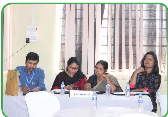
RAPPORTEUR OF TECHNICAL SESSION II AND III