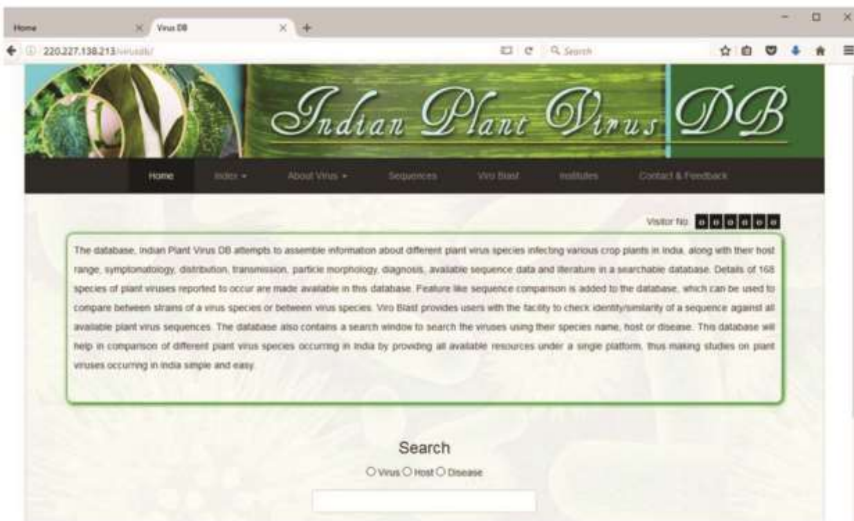
Figure 1. A screenshot of homepage of the Indian Plant Virus Database (IPVdb).